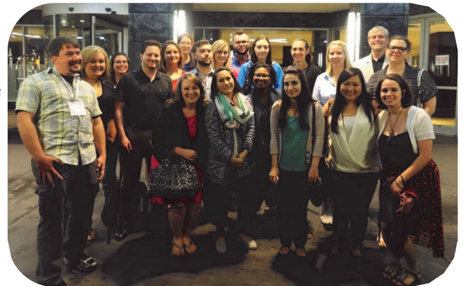
Some new professionals and students in Chicago, IL at the 2014 ASCLS Annual Meeting